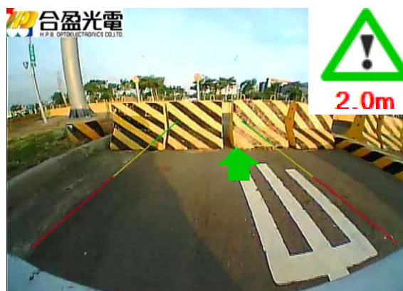
RVDS provides video and distance measurement