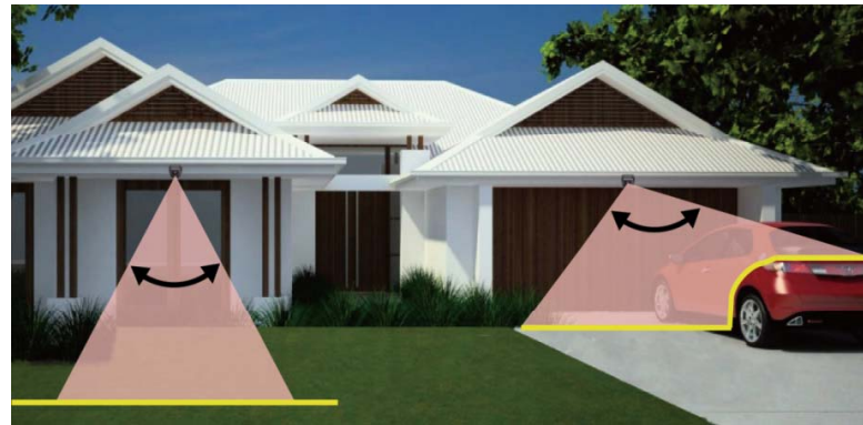
Enhance detection rate with light pattern added